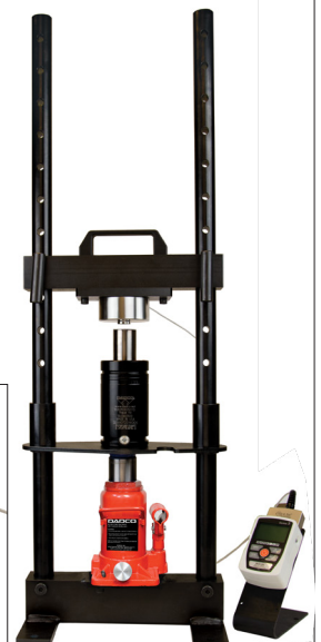
90.305.BGA 90.305.LC.05A 90.305.LC.50A