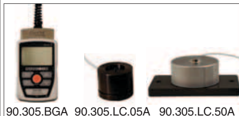
90.305.BGA 90.305.LC.05A 90.305.LC.50A

DADCO's Digital Load Cells and Meter may be used with the Standard Test Stand to measure nitrogen gas spring pressure. The 90.305.BGA meter can display force in N, Kg or lbs. When paired with the 90.305.LC.05A load cell it may be used to measure force up to 22 kN (5,000 lbs). When paired with the 90.305.LC.50A load cell it may be used to measure force up to 222 kN (50,000 lbs). For more information request bulletin B04106C.