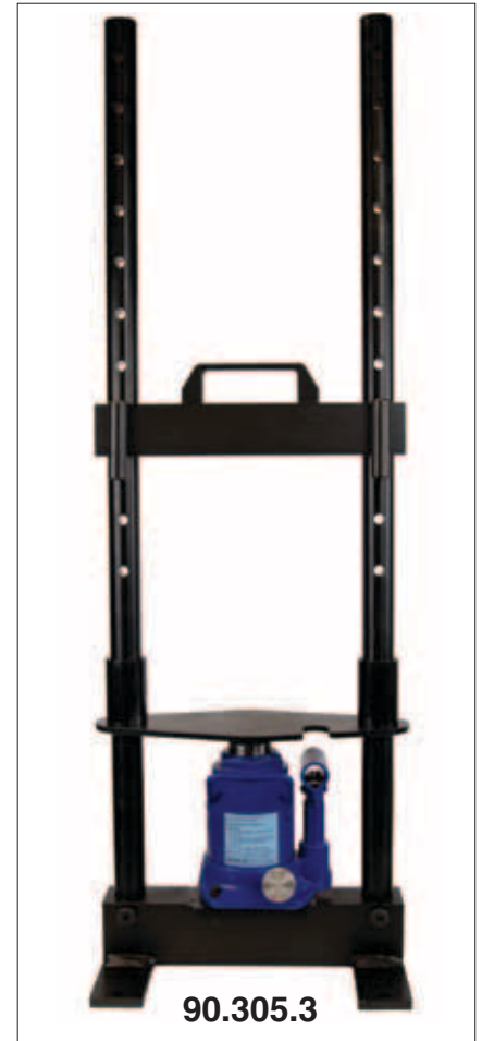
Note: 90.305.3 dimensions are H = 991 mm, W = 305 mm, D = 229 mm Not designed for use as an arbor press.

If your model and stroke are not listed here you may use an arbor press.