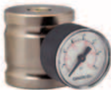
90.300.(model) or 98.300.(model)

DADCO's analog load cells may be used to check the internal pressure of a nitrogen gas spring and quickly determine if the gas spring is charged to the desired pressure. For information on the different load cells request bulletins B15118 and B02119B.