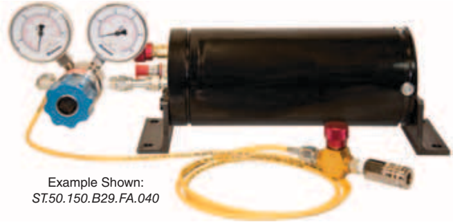
Example Shown: ST.50.150.B29.FA.040

The DADCO Surge Tank with Filling Assembly Kit is designed as an auxiliary filling station for DADCO Nitrogen Gas Springs. Used with DADCO's Compact Nitrogen Gas Booster System (DGB.100), to capture high pressure nitrogen gas, this assembly regulates the nitrogen to a usable pressure, allowing for rapid and transportable filling of gas springs. DADCO offers three assembly kit configurations for your new or existing surge tank.